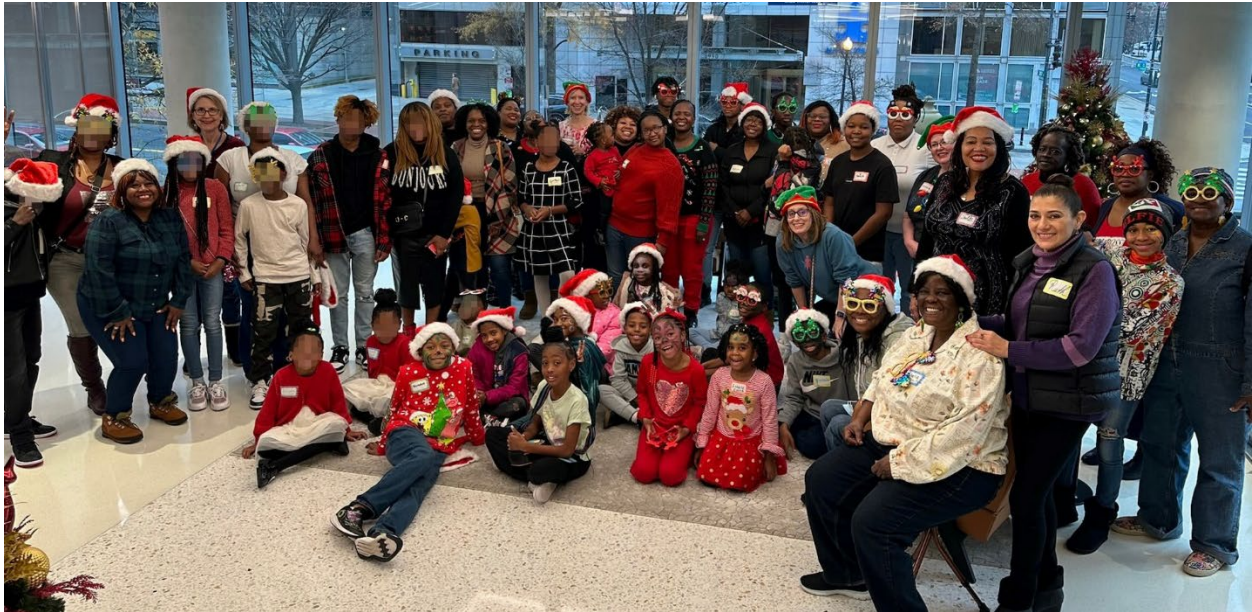
Relative Caregiver Community Board Christmas Party 2023

how to address them. The Community Board also welcomes outside speakers, including experts in special education services and other topics of interest to the caregivers. Additionally, two members of the organization's corporate Board of Directors have lived experience as part of kinship families.