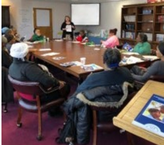
Caregiver Raise Me Up Educational Group

Lawyers for the program continuously educate their caregiver clients on legal options and their implications for the family through community seminars called "Caregiver Raise Me Up Groups." This education piece is vital, as it helps families to thoughtfully pursue the option that makes the most sense for them. While meeting with families to discuss the relevant legal and financial issues is important, so too is having a clear, written guide. DC KinCare Alliance has done an exceptional job compiling an annually updated, step-by-step resource guide for their clients and any kin caregiver in the District of Columbia. Providing information in a written format allows caregivers to read, re-read, and contemplate their path forward.